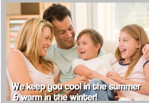
All Systems Inc...Here When You Need Us Most!